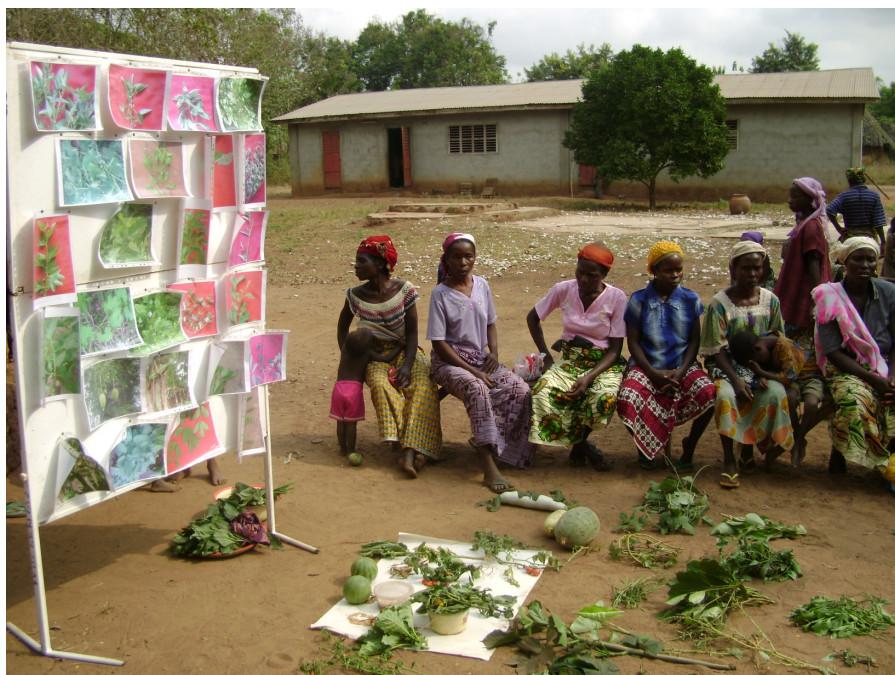
Figure I: Focus group with farmers in Ayetedjou (Benin)